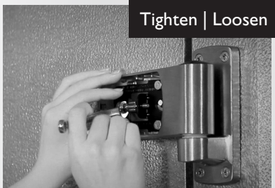
Tighten | Loosen

Using a standard ratchet set, loosen the four corner bolts. NOTE: Do not remove these bolts, just loosen enough to allow the door to move to a square position.